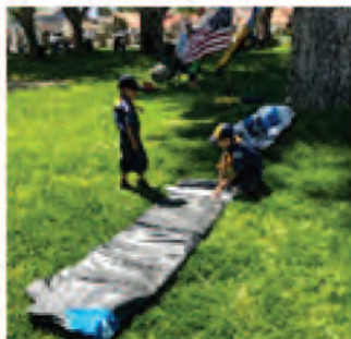
The Scouts do a fine job of Presenting the Colors before the monthly Board Meetings.