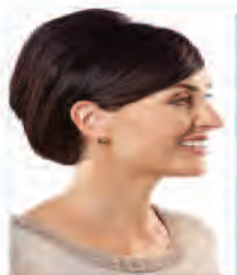
Look, she's wearing Beltone Hearing Aids!

We believe your hearing is too important to trust to just anyone. It's crucial to choose a qualified provider who offers award-winning technology along with compassionate care – like Beltone .