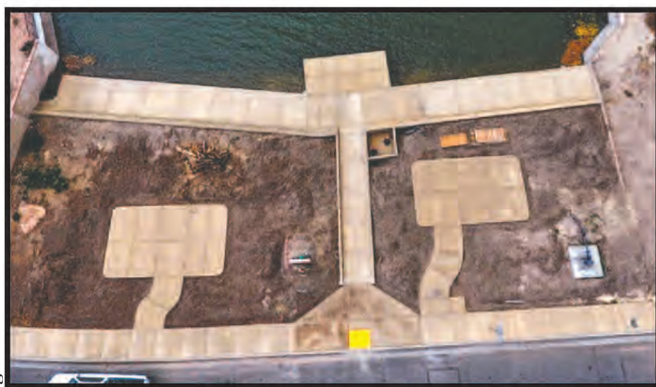
Aerial view of Fishing Area 10 prior to the landscaping being installed

Red Ear Sunfish and Crappie. All of these are currently species that self propagate in our lake. We are just adding to the current population for a healthy fishery. Trout do not reproduce and need to be purchased yearly for cold temperature fishing.