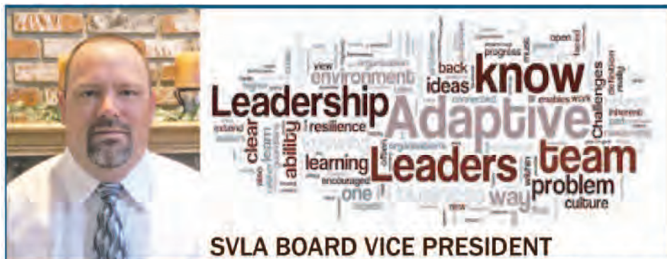
SVLA BOARD VICE PRESIDENT