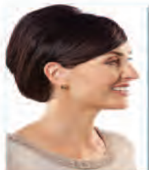
Look, she's wearing Beltone Hearing Aids!

And, we've been the experts for 75 years! We believe your hearing is too important to trust to just anyone. It's crucial to choose a qualified provider who offers award-winning technology along with compassionate care – like Beltone .