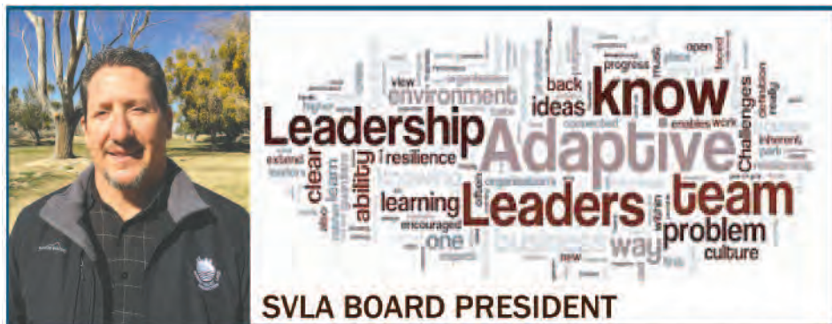
SVLA BOARD PRESIDENT