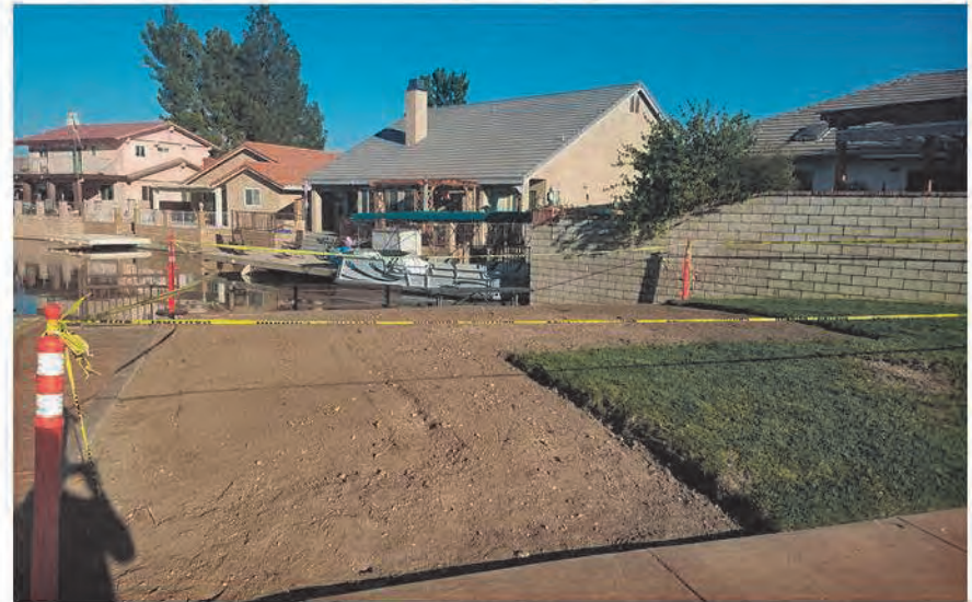
Current picture of Fishing Area #6

Make sure to stop by and see the progress that is taking place!