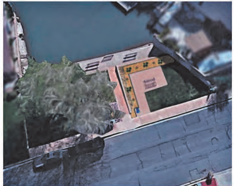
Projection of Fishing Area #6 with upgrades